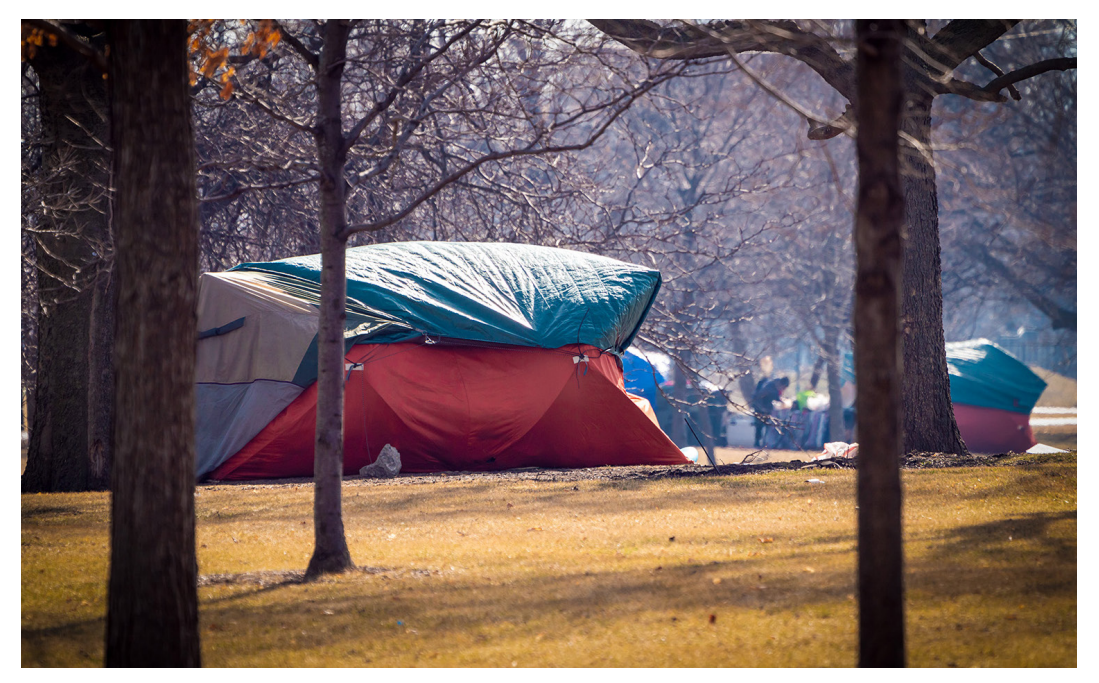
Tent shelters during the winter season in Chicago.