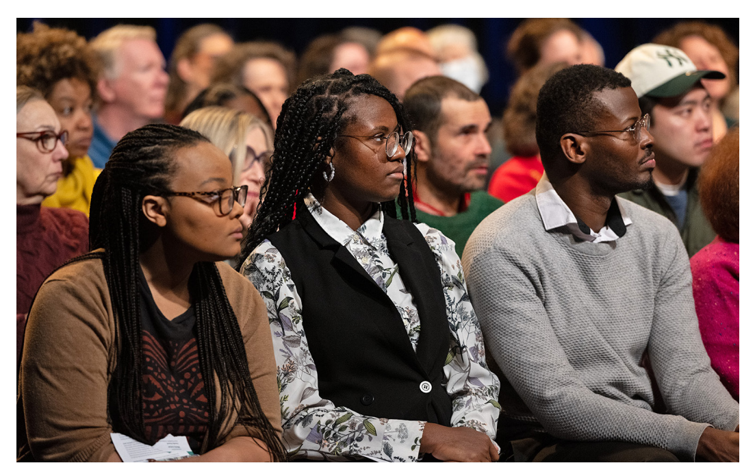
The audience looks on during the filming of the Firsthand: Homeless Talks at the WTTW Studios in Chicago.

However, Firsthand: Homeless does not offer simple solutions to this complex problem. The stories reveal generational trauma, mental health issues, substance abuse, and the reality that becoming unhoused is never a result of "just one thing." Homelessness is one of those topics that can leave Americans despairing, as it demonstrates what should be obvious: a wealthy society doesn't have to accept as inevitable throngs of people sleeping on sidewalks or under bridges. Firsthand: Homeless invites viewers to listen and learn from the experiences of others to expand understanding and learn from the community leaders and organizations committed to finding stable housing for every member of their communities.