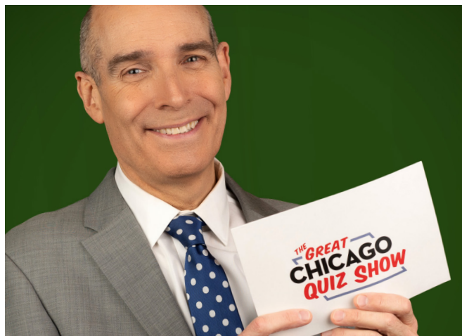
GREAT CHICAGO QUIZ SHOW WITH GEOFFREY BAER

candidate forums, and launched a comprehensive digital Voter Guide that provided profiles of the candidates and key issues and a searchable map by congressional district.