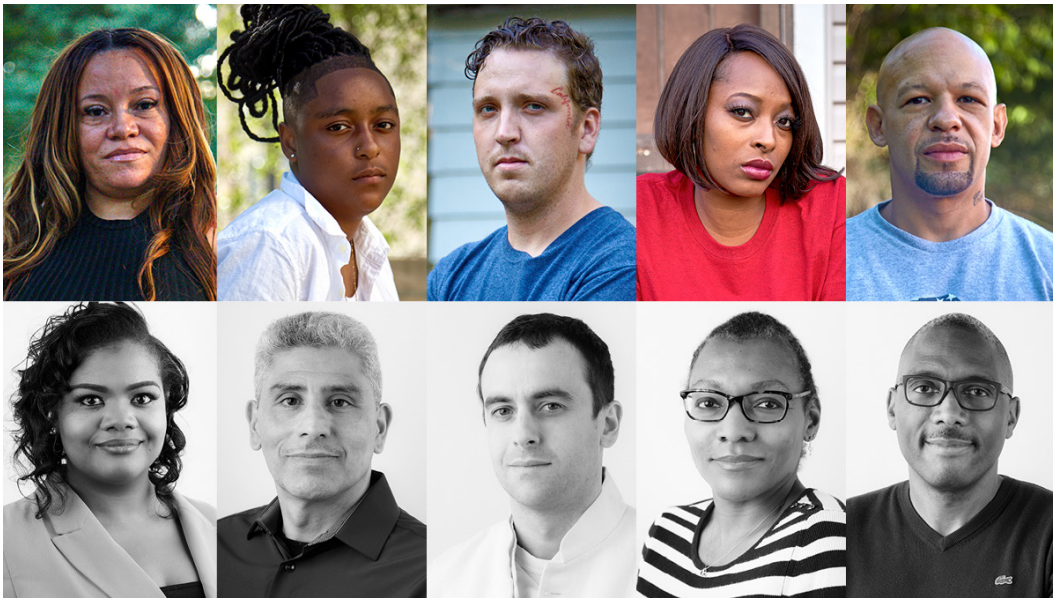
FIRSTHAND: Living in Poverty subjects and experts