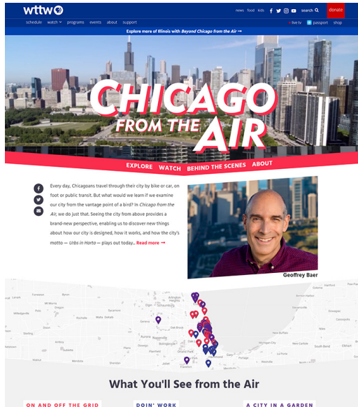
CHICAGO FROM THE AIR homepage

their stories. WTTW hosted a free virtual community screening event prior to the premiere.