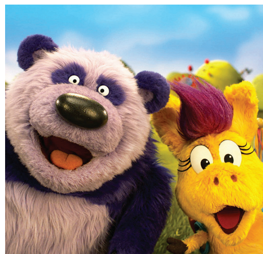
DONKEY HODIE, filmed in WTTW's studios

Research shows that parents and caregivers trust WTTW and PBS Kids content. Every day, children laugh and learn with the characters they've come to consider trusted guides and friends. This trust is at