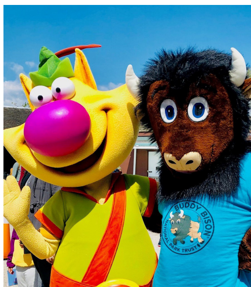
Nature Cat and Buddy Bison

In FY2021, WTTW's 36 virtual screenings and panel discussions attracted more than 46,000 attendees, with a total of almost 109,000 participating across all event categories, including kids and families.