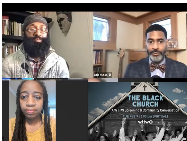
THE BLACK CHURCH: THIS IS OUR STORY, THIS IS OUR SONG virtual event

As a trusted organization with purpose at the heart of all we do, WTTW has a unique opportunity to reach