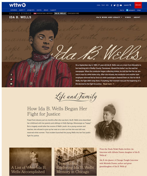
IDA B. WELLS website

a deeply humanizing portrait of a woman who was uncompromising in her quest for justice. The program tells the story of Ida B. Wells through interviews with her descendants and Pulitzer Prize-winning journalist Nikole Hannah-Jones, creator of the Ida B. Wells Society for Investigative Reporting and the landmark 1619 Project. The website explored Wells' accomplishments and the causes she championed, her investigative reporting, and her life and family. WTTW hosted a behind-the-scenes preview and discussion with the filmmakers and some interview subjects, including Hannah-Jones.