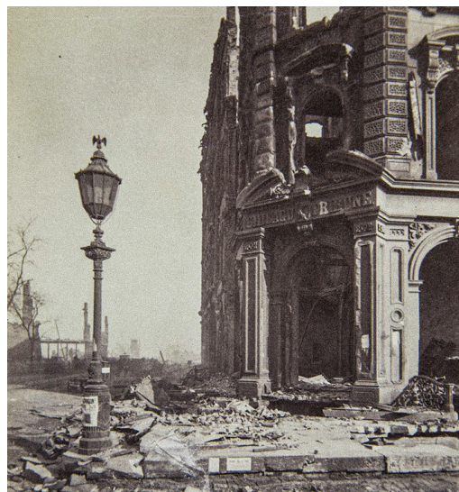
THE GREAT CHICAGO FIRE: A CHICAGO STORIES SPECIAL