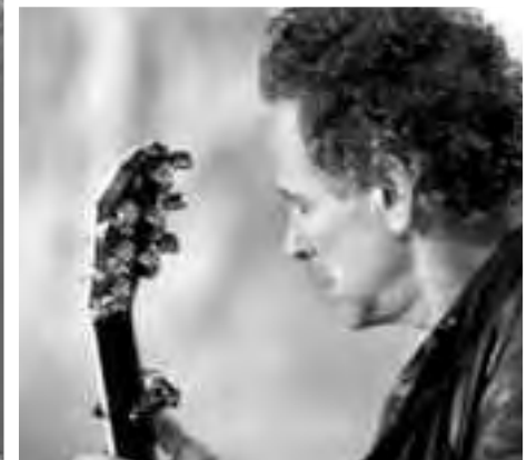
Clockwise from upper left: Russell Crowe, Burt Bacharach with Ron Isley, Cyndi Lauper, Lindsay Buckingham, Adam Duritz, Sheryl Crow perform on Soundstage